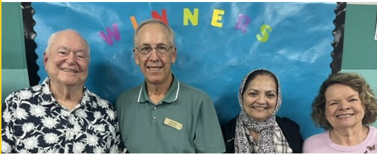
Winners of Their First Gold Points