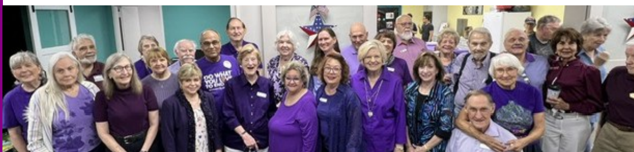
Do What You Love Game

Check the BCOH Website for more including details, potlucks and points each week.